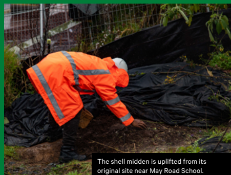
The shell midden is uplifted from its original site near May Road School.