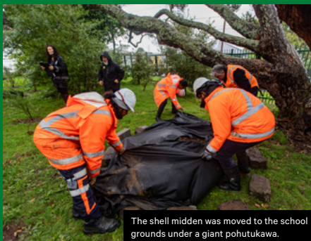
The shell midden was moved to the school grounds under a giant pohutukawa.