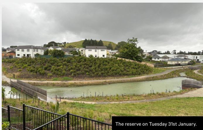
The reserve on Tuesday 31st January.