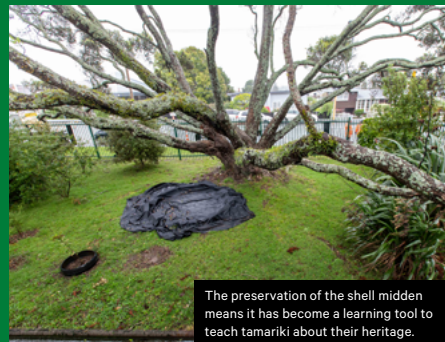
The preservation of the shell midden means it has become a learning tool to teach tamariki about their heritage.

At the moment, the shell midden has been blessed by Ngāti Whātua Ōrākei and Te Ākitai Waiohū, and is resting under the safety of an ancient pohutukawa tree on the school grounds.