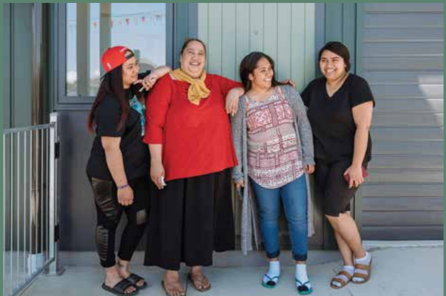
Northcote residents outside their new state home