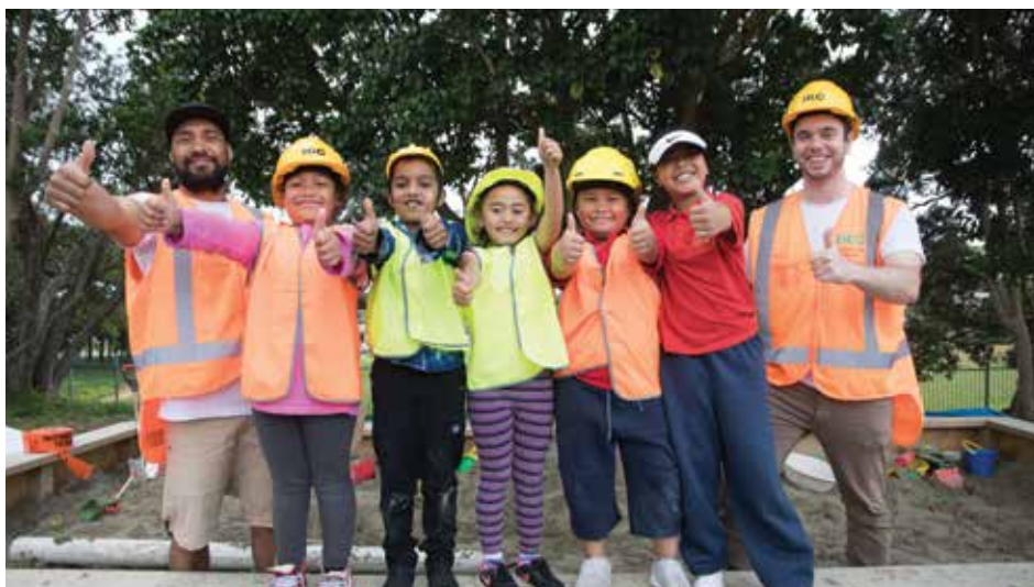
Above: Children from May Road School with HLC’s project team