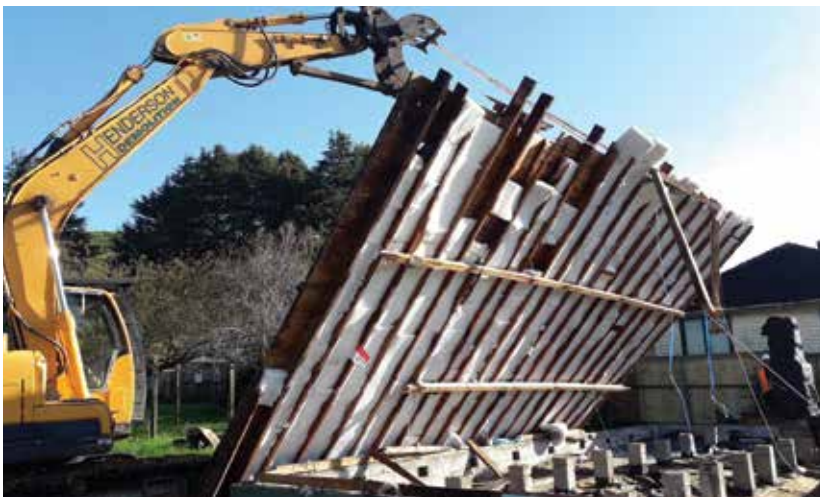
Removing floorboards from an old state house in Mt Roskill South to be repurposed

The demolition material is taken to Green Gorilla's recycling facility where around 85% of it is recycled. This includes wood, steel and plasterboard. Concrete footings, along with other materials that aren't recyclable, are taken to landfill.