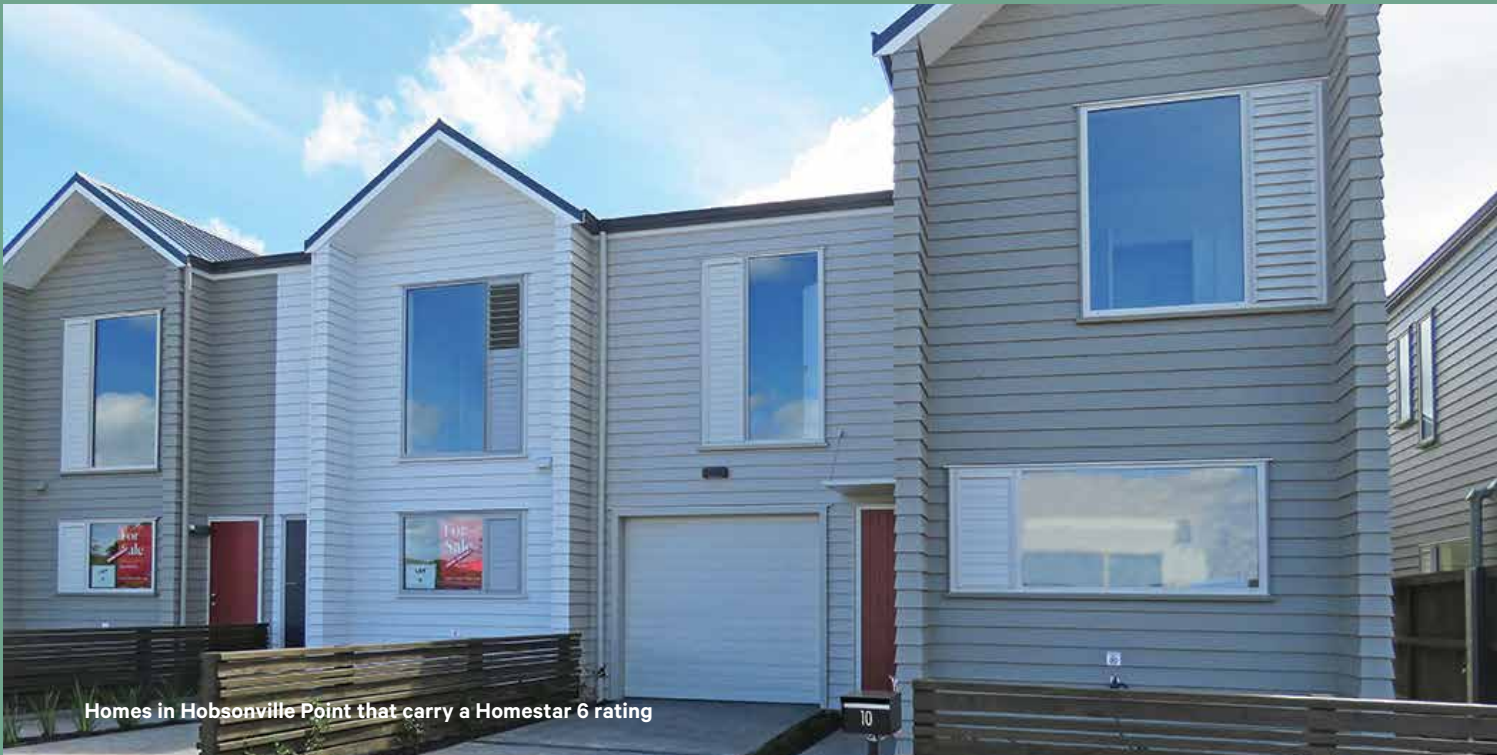
Homes in Hobsonville Point that carry a Homestar 6 rating

simple design choices like orienting the house and placing windows to maximise sunlight, installing a washing line to reduce reliance on the dryer, taps and toilets that use less water, and energy-efficient lighting. Combined with increased insulation, efficient heating and thoughtful landscaping, new houses in the Mt Roskill Development will be warm, dry and more affordable to run.