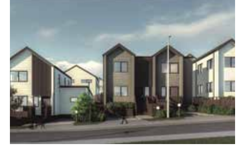
Artist impression of Housing New Zealand homes along Freeland Ave, Burnett Ave and Sanft Ave

For more information on changes in the area, take a look at the timeline over the page which shows what we've achieved so far, and what we aim to achieve in the future.