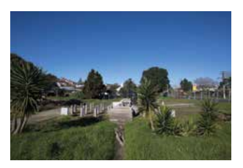
The construction site for the new information centre on the corner of May Road and Glynn Street