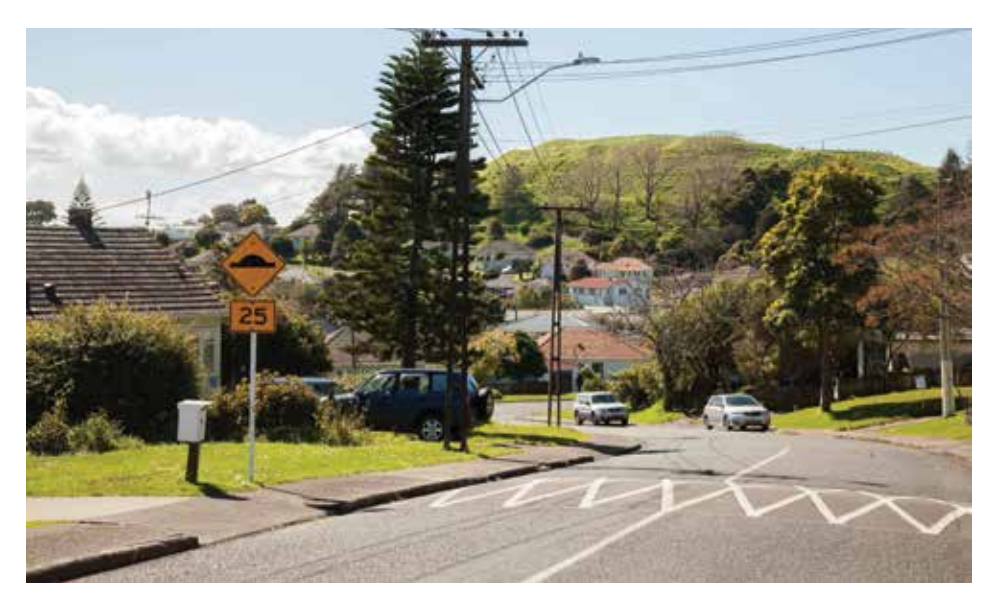
Street view of the trees in Mt Roskill South

Remediation means making the land safe to build on and live on. Sometimes contaminants leach into the land and require removal. For example, lead that has leached out of old paint on an older house by rainwater is collected in the surrounding soil, requiring the top layer of soil to be removed. We take the opportunity to dig up and remove old obsolete pipes and other material too.