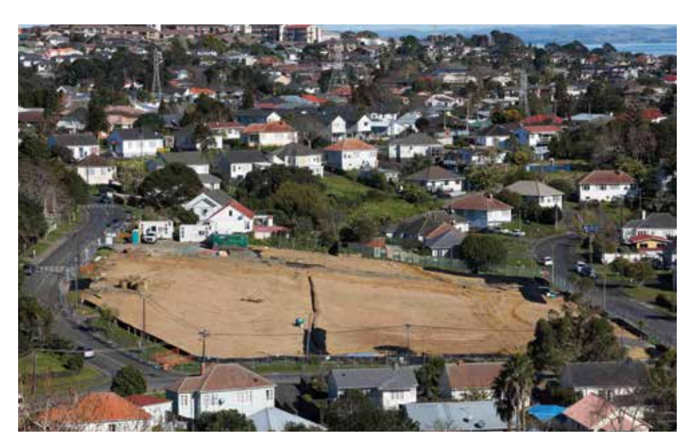
New Housing New Zealand homes under construction on Freeland Ave