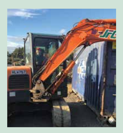
Local children having a turn on the digger at the first HLC BBQ earlier this month.

So save the date, meet the team, and enjoy a sausage or two on us! Halal and vegetarian options available. We'll see you there.