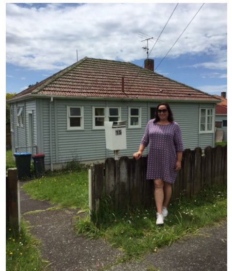
Me at my Great Grandmother's home in Freeland Ave where changes are already happening. I spent a lot of time here with five generations of my whānau.